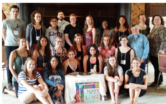
Good Shepherd Volunteers training workshop, In New Jersey, August 20, 2014