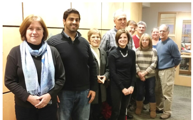
Divorce and Custody Mediation Training in Bethlehem PA at the Offices of King Spry.