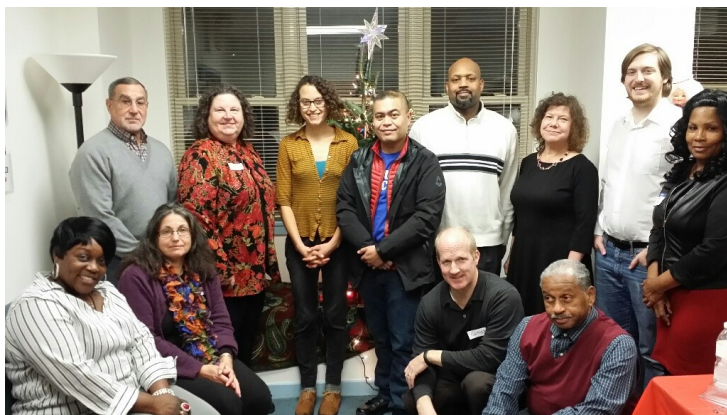
2014 Holiday Party for GSMP Board, Staff and Volunteers.